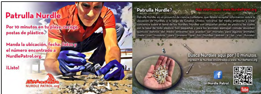
Figure 7. Spanish version of the Nurdle Patrol outreach flyer front and back.

The billboard campaign was created during the first year (2020) of Nurdle Patrol and was a huge success and has been extended into the third year with one near the Formosa Point Comfort (site 355751) in February 2022 and will remain at this site until February 2024 (Figure 8).