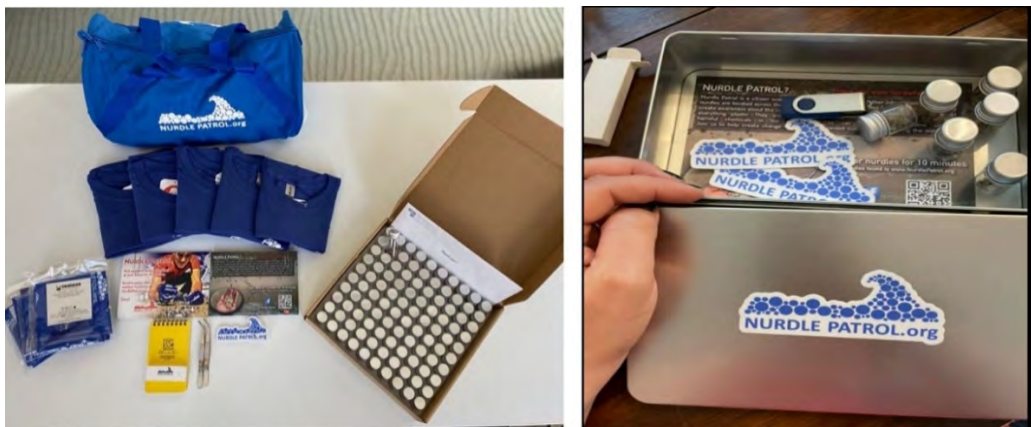
Figure 1. Nurdle Patrol Startup Kit (left) and Teacher Nurdle Kit (right)

The Nurdle Patrol Teacher Kits were also developed during the first year of Nurdle Patrol due to many requests from teachers across the United States that wanted to teach their students about how plastics reach the ocean and what negative impacts plastics have on the environment. These kits include a curriculum about nurdles entering the ocean, what negative impacts there are, and what solutions are out there to prevent nurdles from getting into the waterways. The interactive teacher kits include six jars of nurdles, an information card about how to conduct a nurdle survey, a presentation all about nurdles, and articles describing the problem (Figure 1). An updated version of the teacher kit curriculum was completed during the third quarter which includes an All Level Nurdle Survey, a Nurdle Hurdle Race, K-5 curriculum that includes lesson plans for age specific children in K-1, 2-3, and 4-5, and Middle School and High School Chemistry curriculums. These lesson plans are now linked to our webpage. As of May 31, 2023, 1,778 teacher kits were shipped to educators in the USA, Canada, Mexico, Puerto Rico, Costa Rica, Columbia, Cuba, UK, Spain, Africa, Australia, Turkey, Italy and Thailand. We estimate that each teacher would have 60 students, which means these kits could reach close to 106,680 students, making this an effective tool for educating students about plastics along the Gulf of Mexico and beyond.