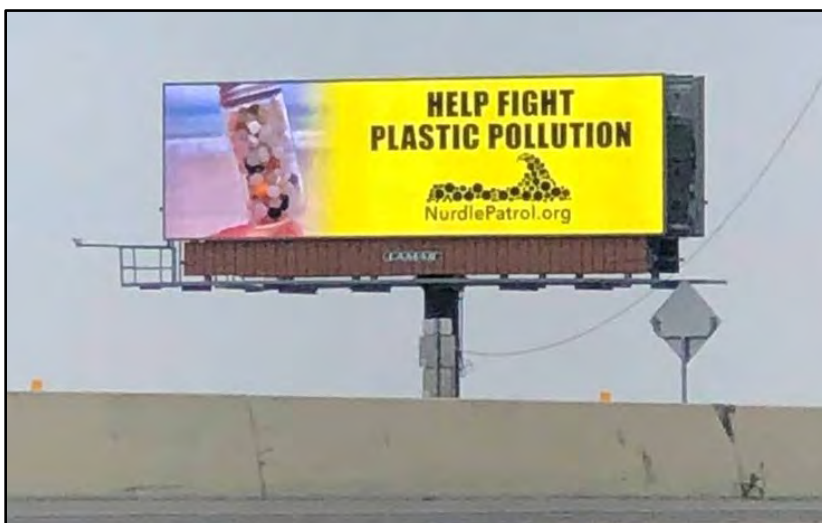
Figure 8. Nurdle Patrol billboard campaign.

The billboard campaign was created during the first year (2020) of Nurdle Patrol and was a huge success and has been extended into the third year with one near the Formosa Point Comfort (site 355751) in February 2022 and will remain at this site until February 2024 (Figure 8).