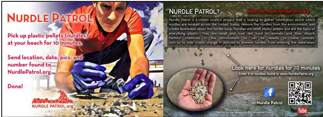
Figure 6. Nurdle Patrol outreach flyer front and back.