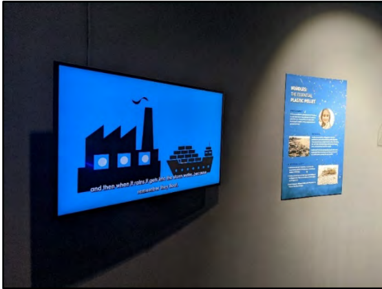
Figure 9. Nurdle Patrol outreach installation at the Texas State Aquarium.

Nurdle Patrol is proud to have an outreach installation at the Texas State Aquarium (Figure 9). The Texas State Aquarium reached out to us in the summer of 2021 to request video footage, images of nurdles, and text on the impact of plastics in the environment. From the information we sent, the aquarium was able to create an exhibit with a video that plays continuously, and a poster display educating folks on what nurdles are, how they get into the environment, and solutions for reducing plastics getting into the ocean.