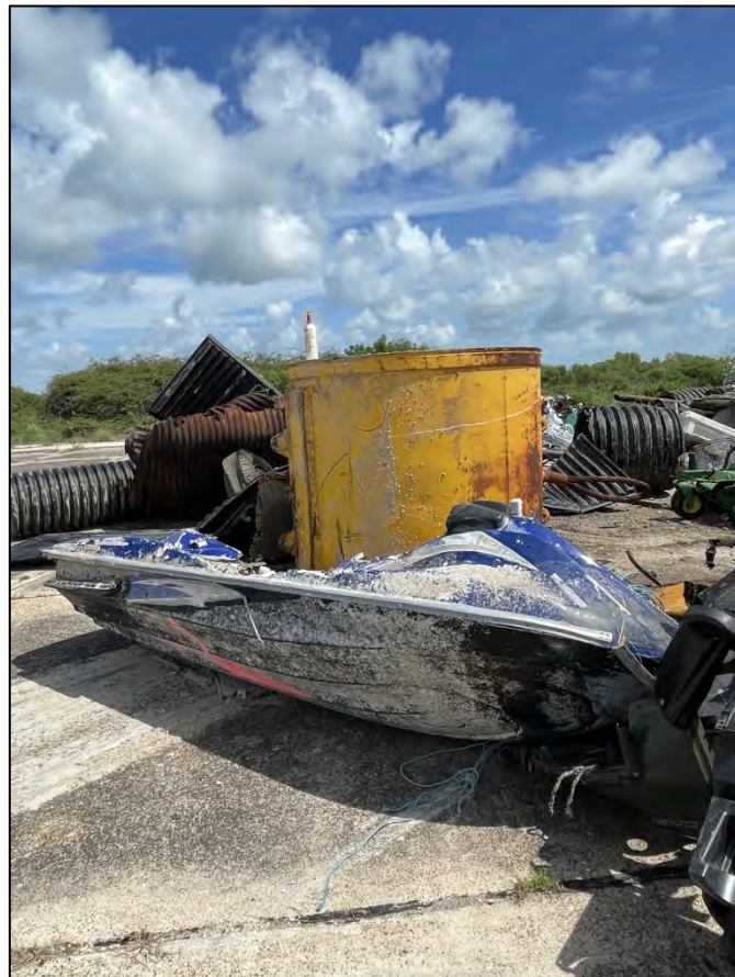
Photo 1. Large debris removed from the Gulf beach of Matagorda Island

CBBEP selected Lester Contracting, Inc. for the Marine Debris Removal on Matagorda Island project. Lester Contracting provided a proposal on August 7, 2024, and a contract was executed on August 12, 2024. Work began on August 12, 2024 and ended on August 29, 2024. The debris removal included 57 tons of non-recyclable trash and 55 tons of scrap metal. The CBBEP worked closely with ANWR staff to coordinate this phase of the project. Below are photographs of the work activities. An article in the Port Lavaca Wave was published on October 9, 2024, highlighting the project and the partnerships.