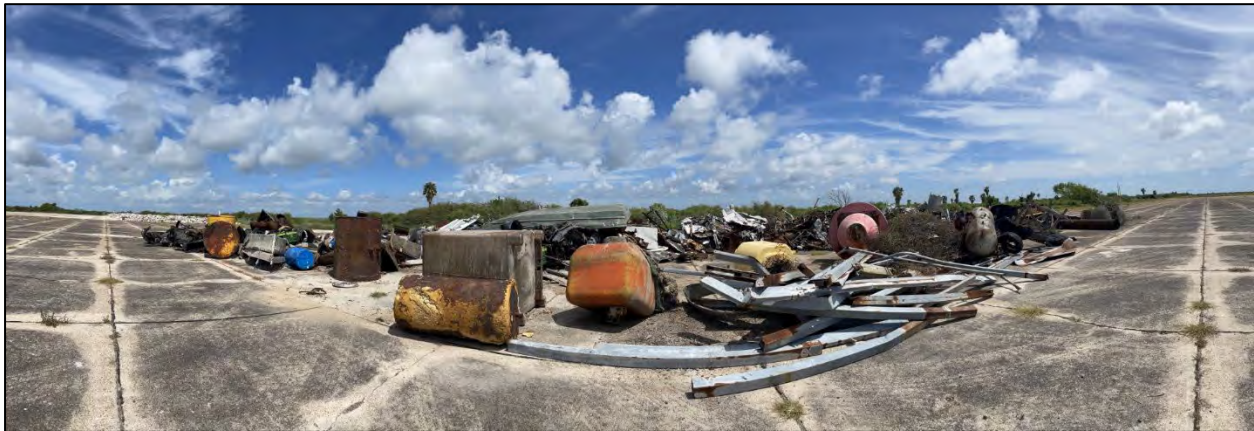
Photo 5. Debris pile on North end of Matagorda Island – ready to be barged off the Island.