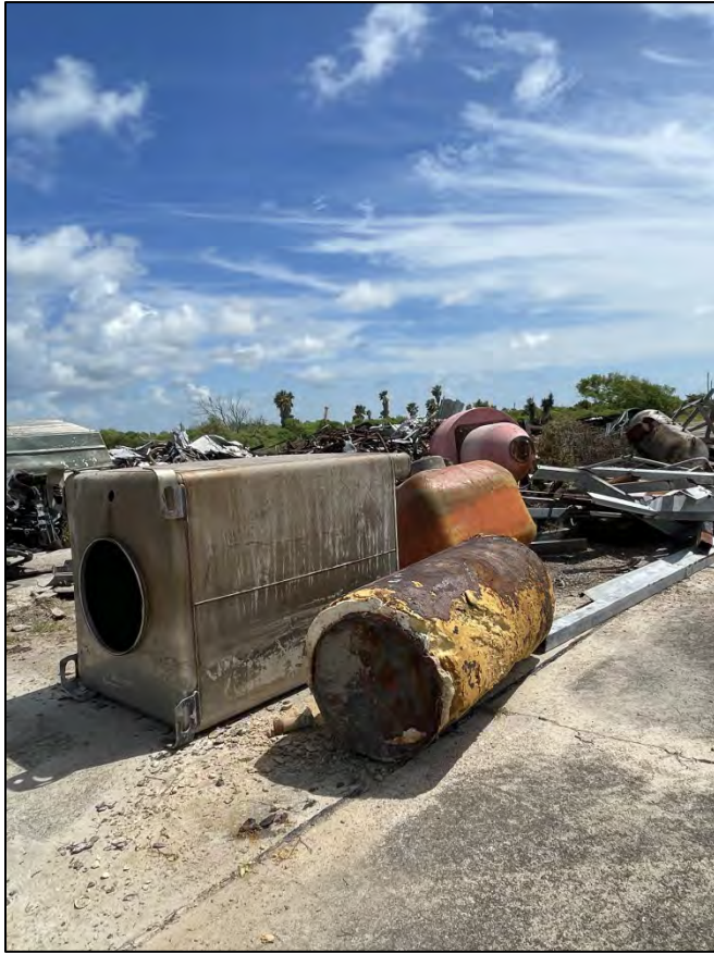
Photo 2. Large debris removed from the Gulf beach of Matagorda Island