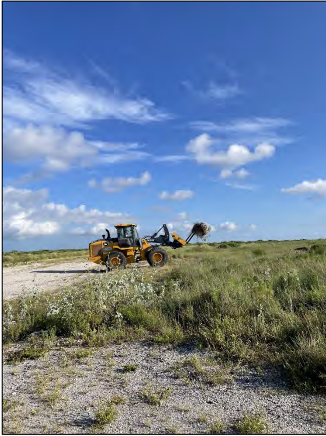
Photo 4. Removing debris from interior of Matagorda Island