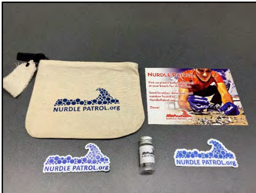
Figure 3. Nurdle Patrol Individual Kit.

Individual Kits were created during the first quarter of year 3 to give individual citizen scientists everything they need to conduct a nurdle patrol survey on a regular basis. The kit includes a cotton zippered pouch with a Nurdle Patrol information card, a glass vial to hold the collected nurdles, a sticker and magnet (Figure 3).