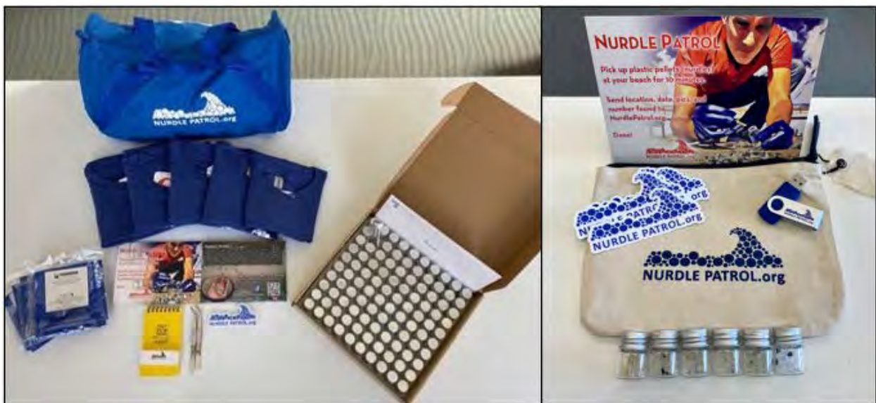
Figure 1. Nurdle Patrol Startup Kit (left) and Teacher Nurdle Kit (right)

The Nurdle Patrol Teacher Kits were also developed during the first year of Nurdle Patrol due to many requests from teachers across the United States that wanted to teach their students about how plastics reach the ocean and what negative impacts plastics have on the environment. These kits include a curriculum about nurdles entering the ocean, what negative impacts they can have, and what solutions are out there to prevent nurdles from getting into the waterways. The interactive teacher kits include six jars of nurdles, an information card about how to conduct a nurdle survey, a presentation all about nurdles, and articles describing the problem (Figure 1). An updated version of the teacher kit curriculum was completed during the third quarter of year 2 which includes an All Level Nurdle Survey, a Nurdle Hurdle Race, K-5 curriculum that includes lesson plans for age specific children in K-1, 2-3, and 4-5, and Middle School and High School Chemistry curriculums. These lesson plans are now linked to our webpage. As of August 31, 2023, 1,874 teacher kits were shipped to educators in the USA, Canada, Mexico, Puerto Rico, Costa Rica, Columbia, Cuba, UK, Spain, Africa, South Africa, Australia, Turkey, Italy and Thailand. We estimate that each teacher would have 60 students, which means these kits could reach close to 112,440 students, making this an effective tool for educating students about plastics along the Gulf of Mexico and beyond.