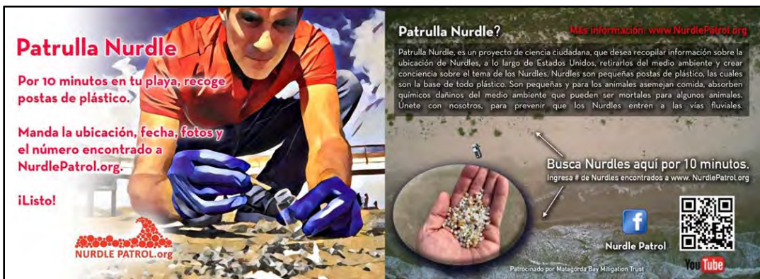
Figure 7. Spanish version of the Nurdle Patrol outreach flyer front and back.

The billboard campaign was created during the first year (2020) of Nurdle Patrol and was a huge success and has been extended into the third year with one near the Formosa Point Comfort (site 355751) in February 2022 and will remain at this site until February 2024 (Figure 8).