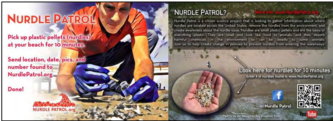
Figure 6. Nurdle Patrol outreach flyer front and back.