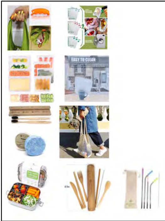
Figure 2. Plastic Free Life Starter Kit items.

nurdle surveys as possible each month. The group that conducts the most surveys will win a Plastic Free Life starter kit that includes 42 single-use plastic alternatives (Figure 2).