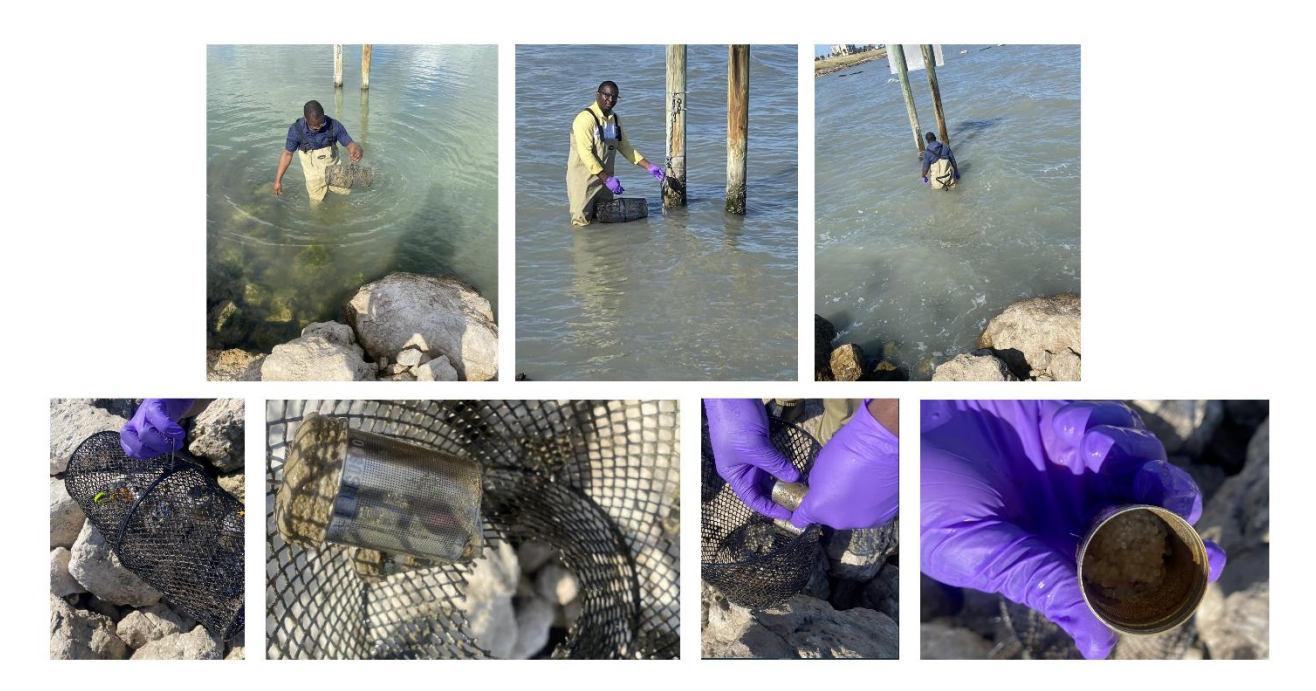
Figure 2: Pilot Sampling to determine environmental rates of Hg sorption to new plastics conducted between October 5-26, 2022.